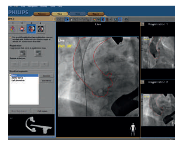
This product is not yet available in Canada