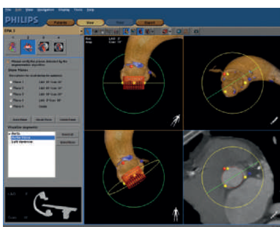
Step 4. Live overlay image. During the procedure, you can use the 3D reference image on the normal monitor and the 3D live overlay on the X-ray image to get real-time feedback as you navigate through vasculature. The overlay automatically follows the C-arm position and all system movements can be controlled at tableside.

Different virtual device templates can be used to check the size of the device. The software selects the optimal projection view for the procedure. You can store various X-ray views for use during the procedure.